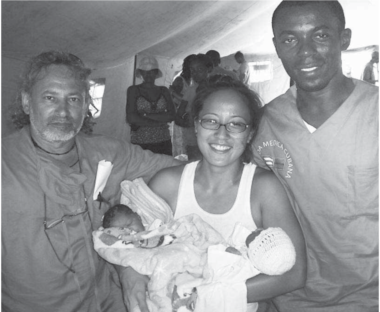
Wing (center) with newly delivered twins