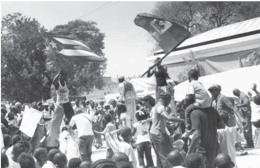
Conga line at Hospital Renaissance