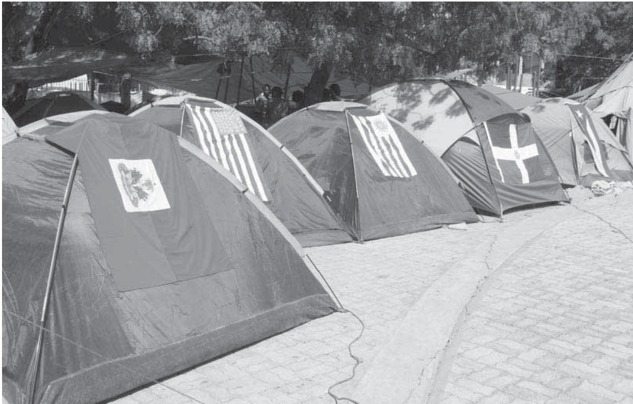
700 graduates and students of ELAM from 27 countries provide emergency medical aid

they have the option of obtaining their family medicine, internal medicine, or surgical specialty studying under Cuban professors.